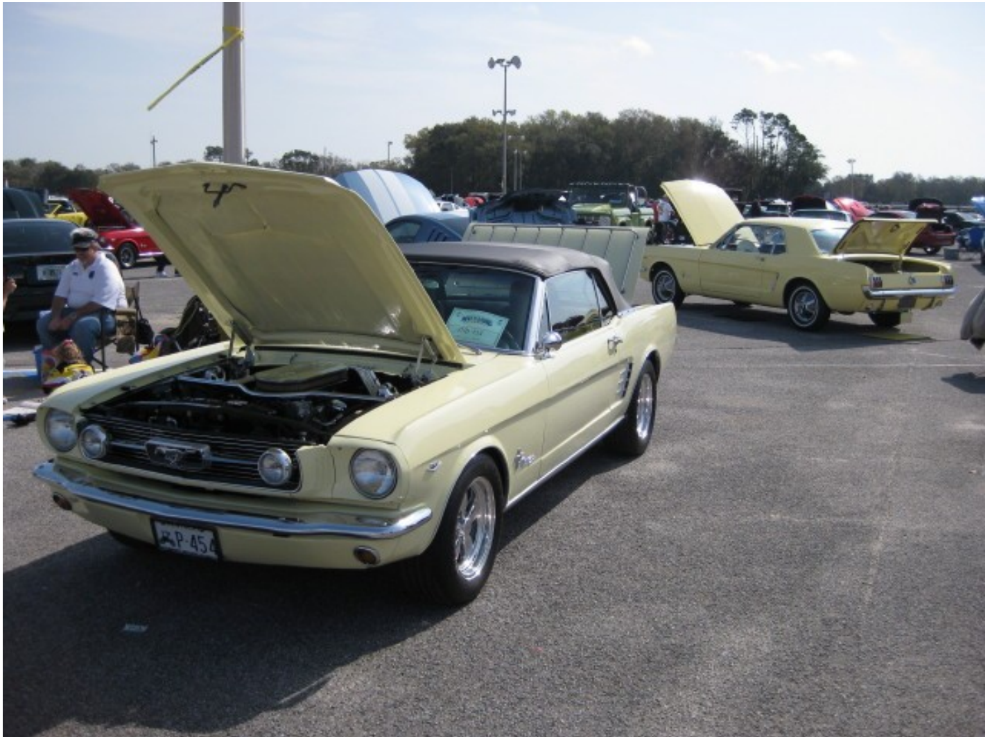
Couple of nice Canary Yellow ponies. An article and more pictures are in the newsletter. Thanks Mike.